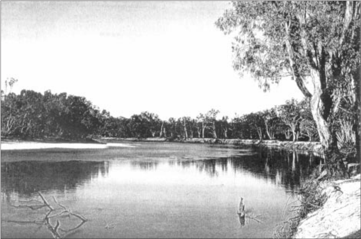
Figure 1. A river flowing through an undeveloped forest area in Victoria