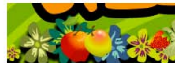
Detail showing drop shadow