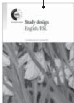
These studies were published by the Board of Studies and were first implemented in 2000 and 2001.