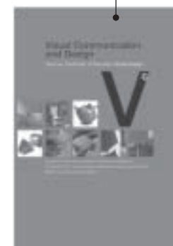
These studies have been published by the Victorian Curriculum and Assessment Authority.