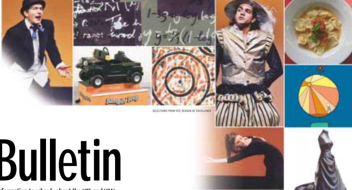
SELECTIONS FROM VCE SEASON OF EXCELLENCE