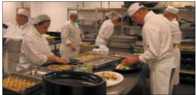
Students from Staughton College in Melton South undertook the catering for the opening of Top Designs at Melbourne Museum on 26 March.

Top Designs at the Melbourne Museum continues until 13 July. Thousands of students have viewed the exhibition and taken part in education programs. Top Arts has enjoyed the same popularity and the millionth visitor to the NGV Ian Potter Centre at Federation Square was a student visiting the Top Arts exhibition. Top Arts closes on Sunday 18 May.