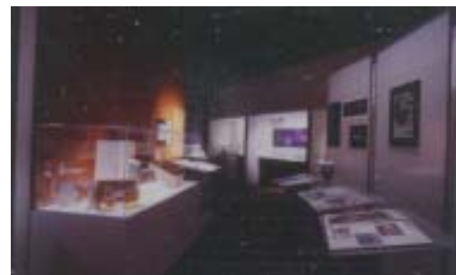
Top Designs 2003 © Narelle Wilson