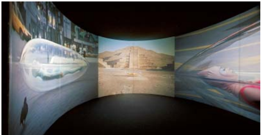
Mariko Mori Link 2000