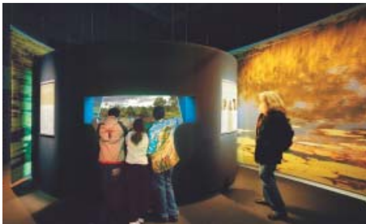
Ngarinyin Pathways Dulwan 1992–2002

Deadline for applications to Top Screen, Top Designs and Top Arts: Thursday 23 October . Application forms are in the August and September VCAA BULLETINS and online at: www.vcaa.vic.edu.au