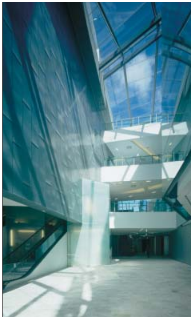
Australian Centre for the Moving Image

Top Arts will celebrate ten years at the National Gallery of Victoria in 2004. Over 700 exhibitors from the last nine years have been sent a request for information with a view to tracking their progress and to select an archive of representative works. However, many addresses are not current. If any teachers have contact details for past exhibitors please contact < anne.harari@ngv.vic.gov.au >. A form is available online at < www.ngv.vic.gov.au/toparts > for past exhibitors to complete.