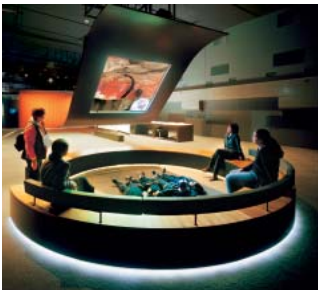
Ngarinyin Pathways Dulwan 1992–2002