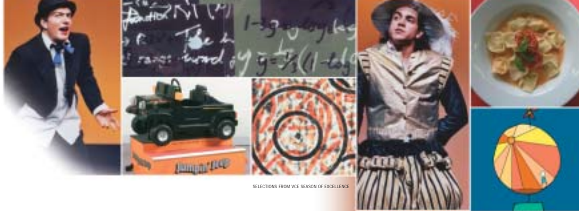
SELECTIONS FROM VCE SEASON OF EXCELLENCE

1. VCE Data Service Online access to school VCE data and analysis