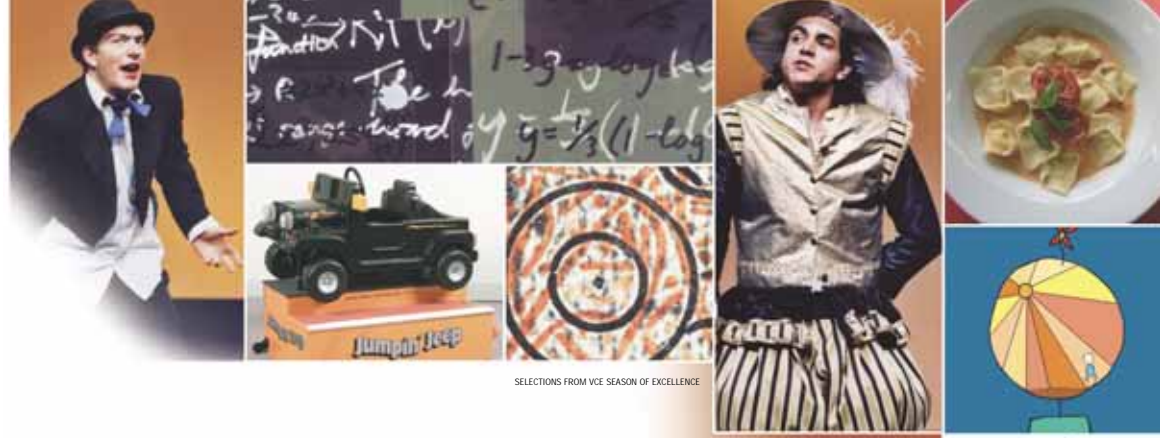
SELECTIONS FROM VCE SEASON OF EXCELLENCE