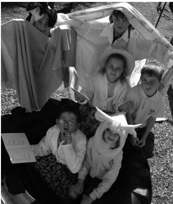
Primary students demonstrating role-playing

Further frequently asked questions about the Standards are located at http://vels.vcaa.vic.edu.au/about/faq.html