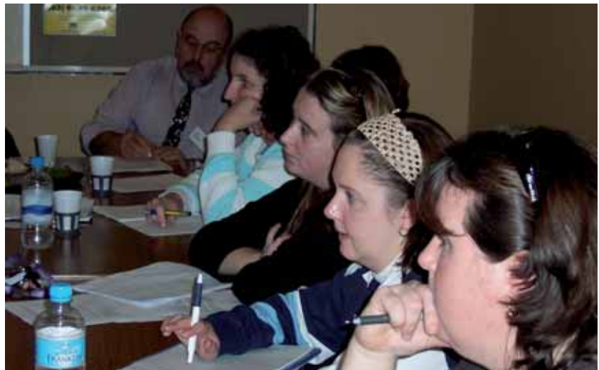
Participants at a focus Group in Benalla discuss the Standards

A report summarising the focus group discussions and the interviews is expected to be completed in early September and will be incorporated into the final validation of the Standards.