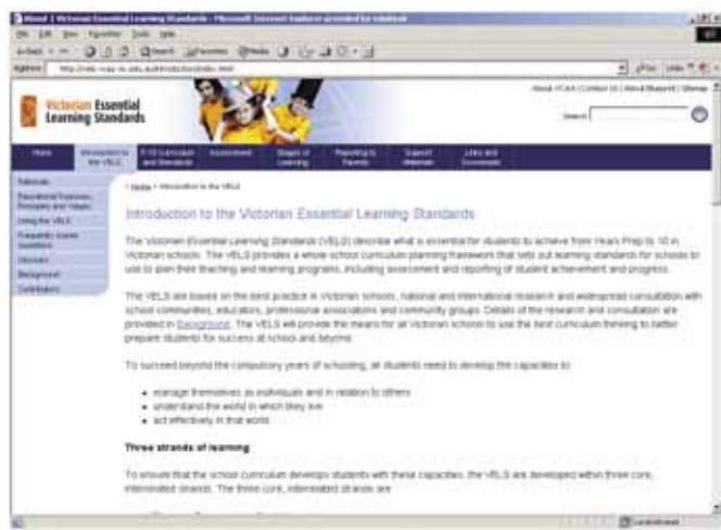
A sample of the new design of the website.

As a result of the feedback, we have refined the appearance of the website to address issues such as distractions, under use of navigation options, the need for summaries of content and greater clarity in the labelling of sections. Responses from users to the changes have been positive. Your continued feedback about the site is welcome. Please send your comments to the P-10 Curriculum Unit via email at curriculum.vcaa@edumail.vic.gov.au