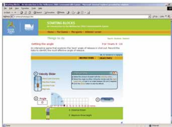
Students investigate how the angle of release impacts on the distance a shot put can be thrown.

More information can be found on the Education Program section of the 2006 Commonwealth Games website at < www.melbourne2006.com.au/education >.