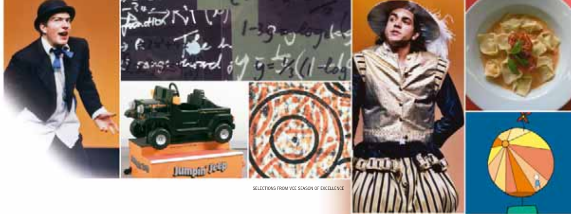
SELECTIONS FROM VCE SEASON OF EXCELLENCE

P-10 Supplement Issue 15 1. VCE VET Multimedia Examination 2005-2006 Revised Advice