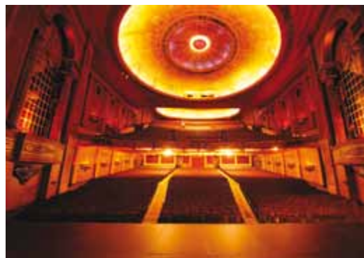
Palais Theatre interior

Performers have been selected from the eleven Top Class concerts held from February to early April and the cast are now rehearsing in readiness for the stunning Season finale. Moving the concert to The Palais has presented an opportunity to refocus the show and guests are in for a wonderful night's entertainment.