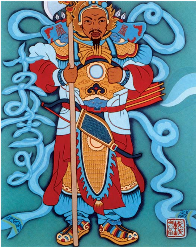
152 x 120 cm