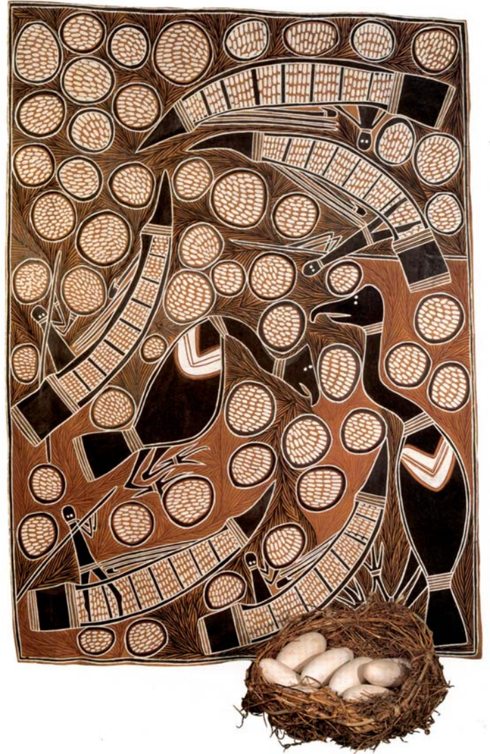
123 x 94 cm