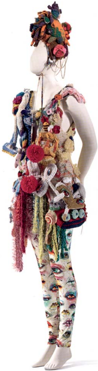
10. Romance was Born, Australia (Sydney fashion house), crazy crochet dress, Del eye leggings and crochet rooster beanie, Garden of Eden collection, 2008