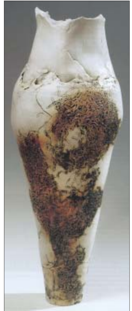
79 cm height