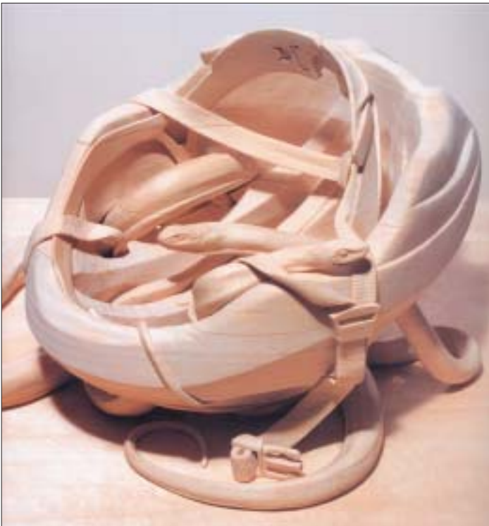
51 × 46 × 24 cm