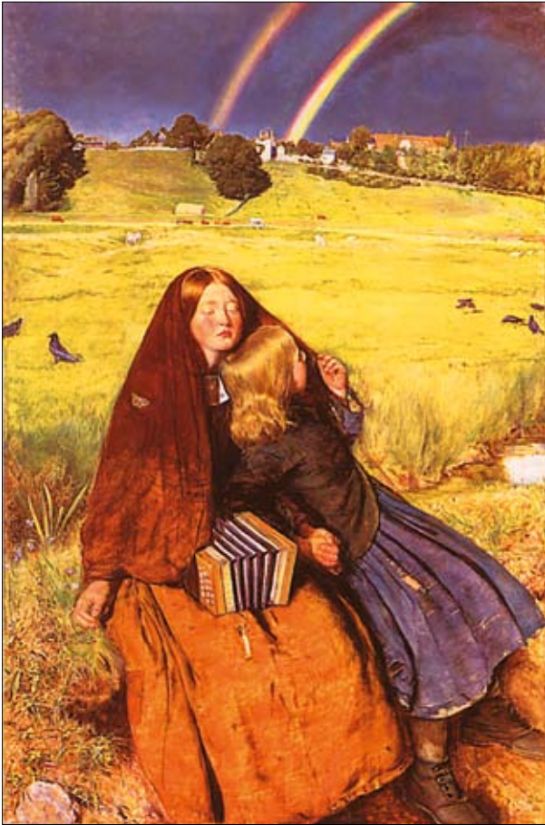
81 × 53 cm