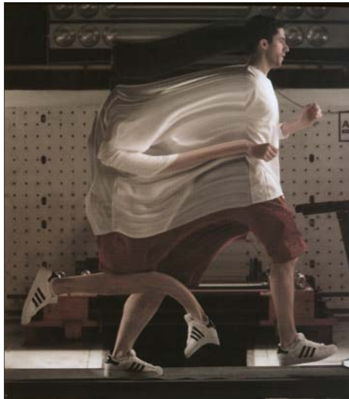
6. Daniel Crooks, New Zealand/Australia, Static Number 11 (man running) , 2008, production still, 04:32 min, single channel HD/BluRay, stereo, edition of three