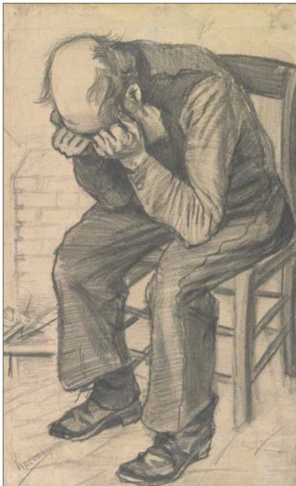
50.4 × 31.6 cm