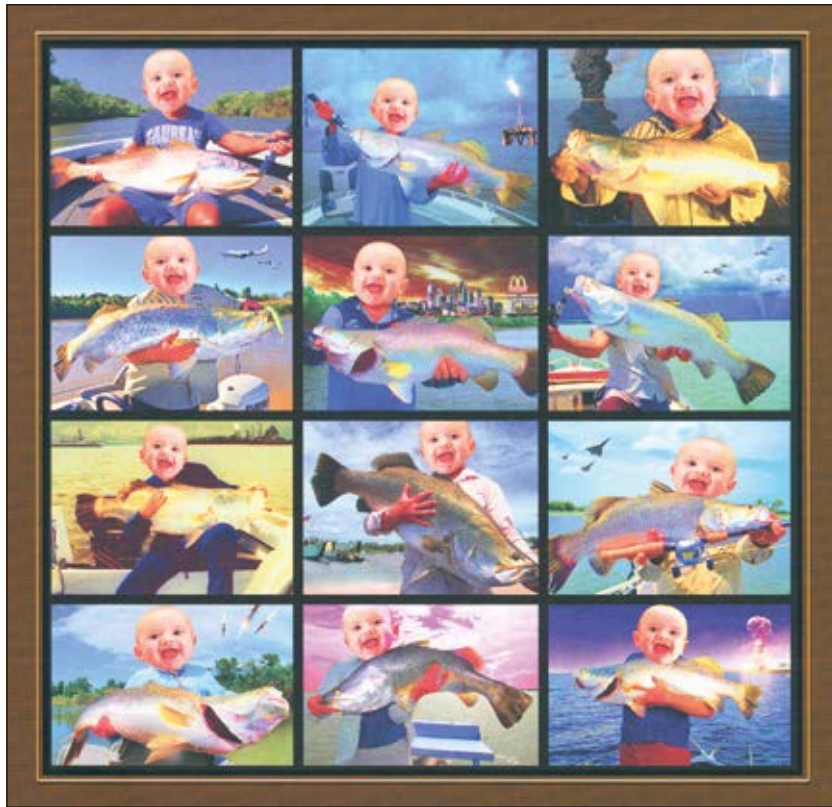
120 × 120 cm