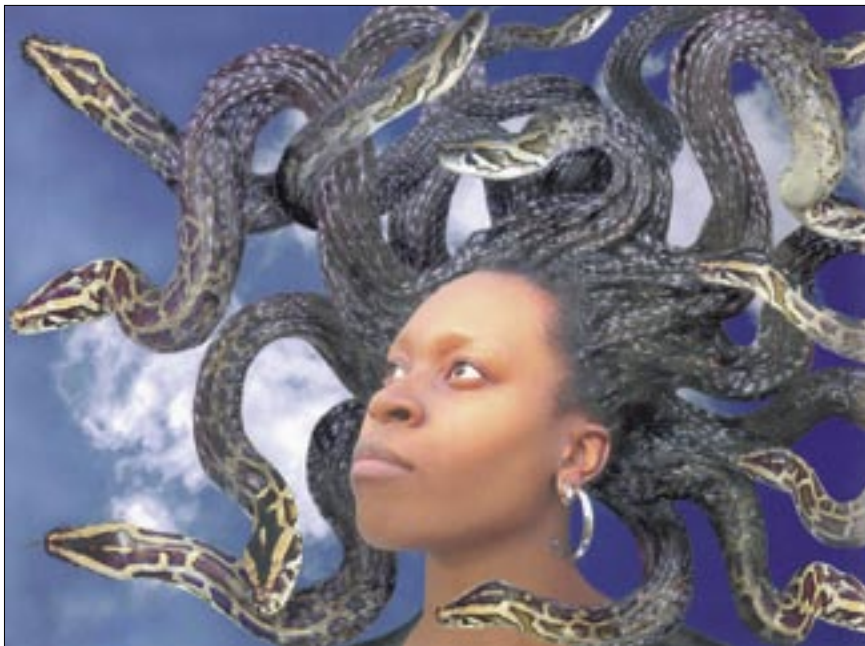
3. Tania Joyce, Medusa , c. 1995, digital photography.