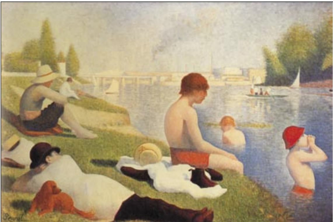
5. Georges Seurat, Bathing at Asnieres , 1883, oil on canvas.