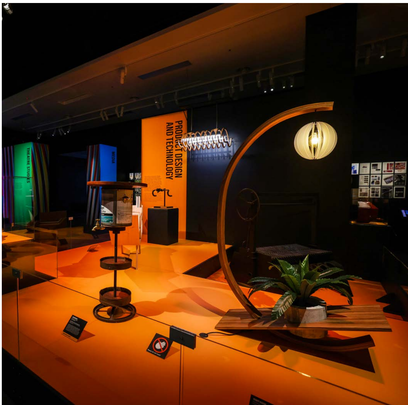
Part of the Top Designs 2022 gallery space at Melbourne Museum, with Product Design and Technology works on display.

Top Designs will be open until Sunday 10 July. Bookings can be made through the Melbourne Museum . Visit the Season Hub for further details and updates.