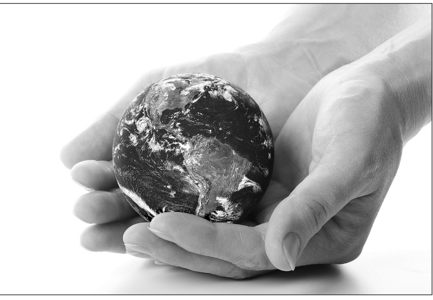
Closing slide of the speaker's presentation