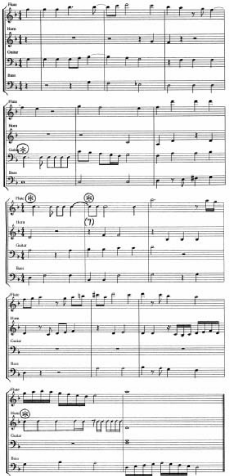
Part 3 – Rhythm Question 5 (4.69/8) Transcription of Rhythms

This question was generally very well answered. Most students appear to have worked out that almost all of the rhythmic figures to be transcribed appeared elsewhere in other parts. As might be expected, problems experienced were most commonly with the dotted crotchet in the first bar (guitar part) and the second bar (flute part), plus the crotchet tied to the quaver across the second and third bars to be transcribed. The minim in the third bar presented problems for some students as well. Perhaps understandably, many of the weaker students had trouble with the semi-quavers on the offbeat of '2' and the six consecutive semi-quavers from the offbeat of '3' through beat '4' in the fourth bar to be transcribed (the horn part). The problems with the six consecutive semi-quavers was a bit surprising given that the